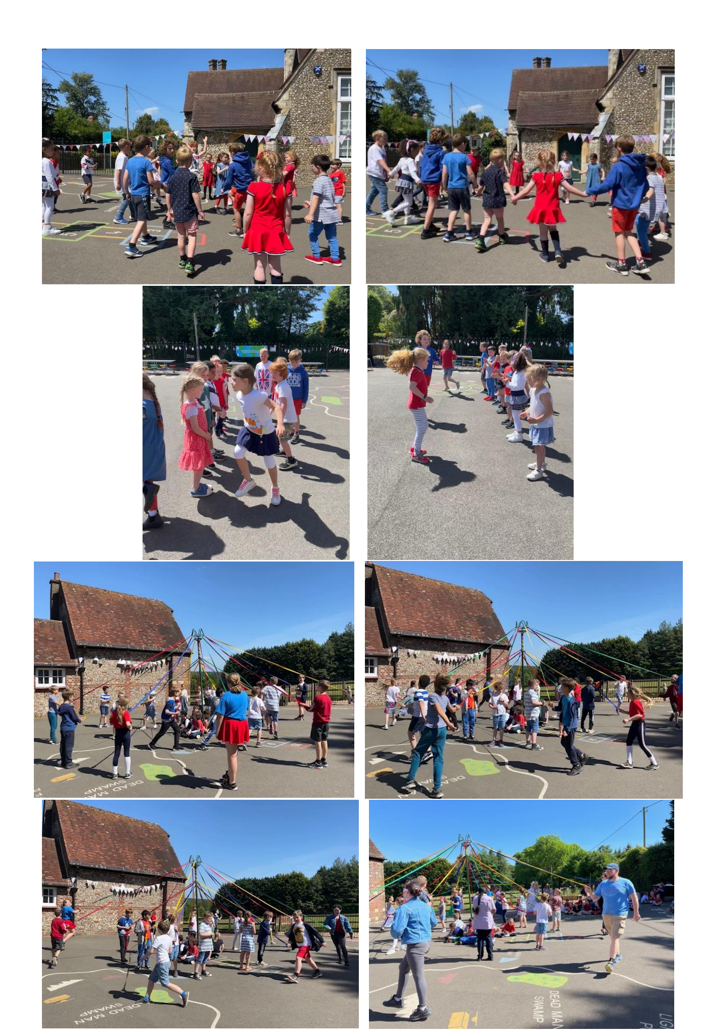
Love – Courage – Respect – Community – Perseverance 'Whatever I have, wherever I am, I can make it through anything in the One who makes me who I am' Philippians 4:13