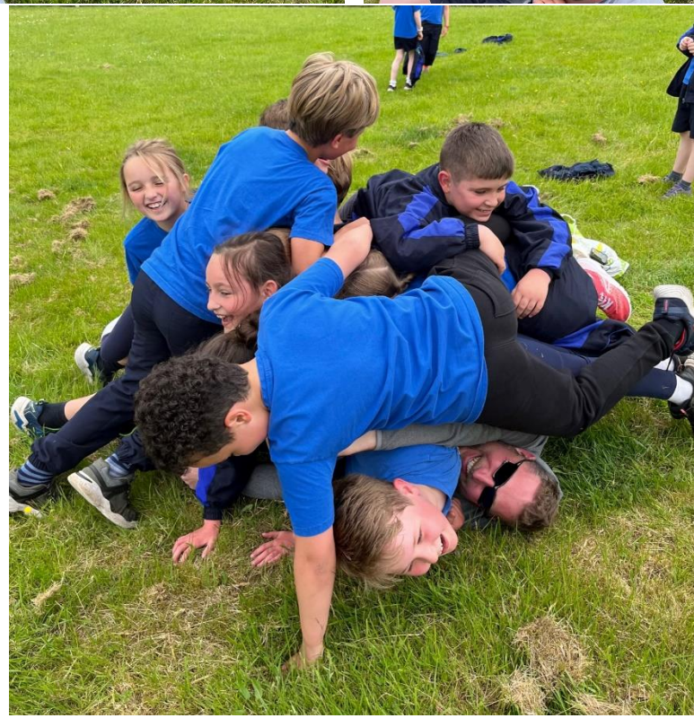
Love – Courage – Respect – Community – Perseverance 'Whatever I have, wherever I am, I can make it through anything in the One who makes me who I am' Philippians 4:13